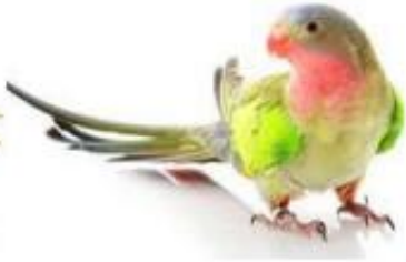
Princess Parrot (Australian Outback)