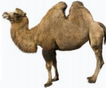
Bactrian Camel (Gobi Desert)