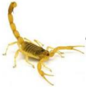
Scorpion (Sahara Desert)

Many different species of animals have become experts at surviving in extreme conditions.